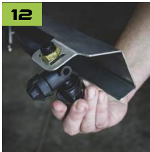
Easy Access Nozzles