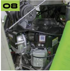
21 HP Engine